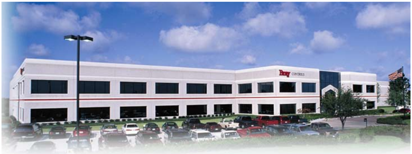
Bray International - Houston, Texas