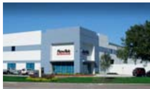
Flow-Tek - Houston, Texas