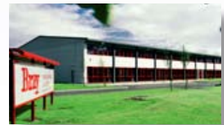
Bray United Kingdom