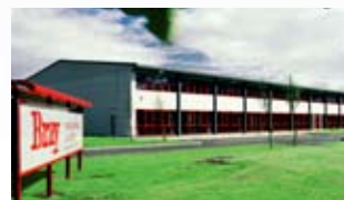
Bray United Kingdom