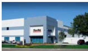
Flow-Tek - Houston, Texas