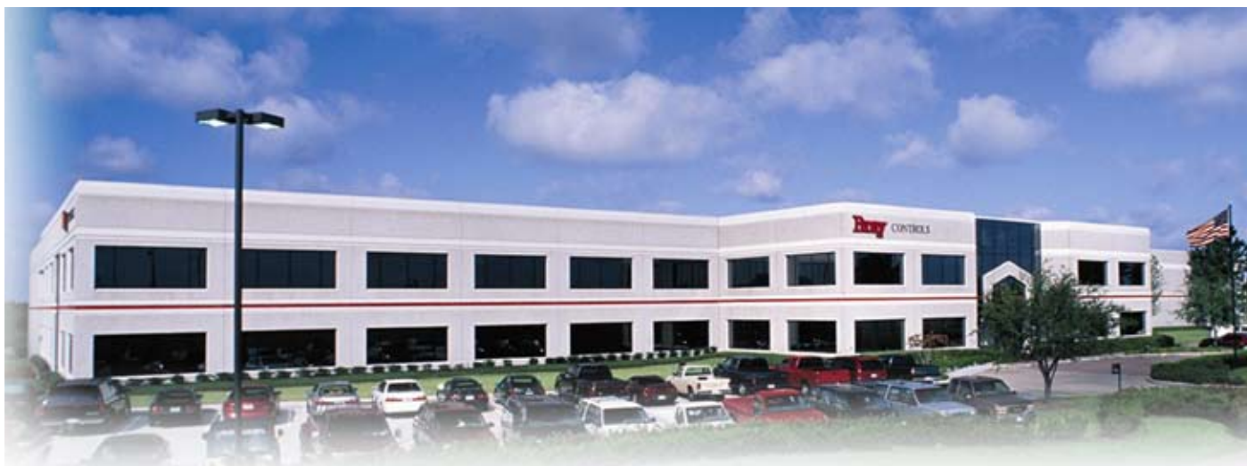
Bray International - Houston, Texas