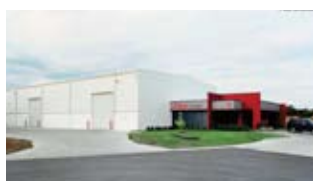
Bray Pacific (Australia)